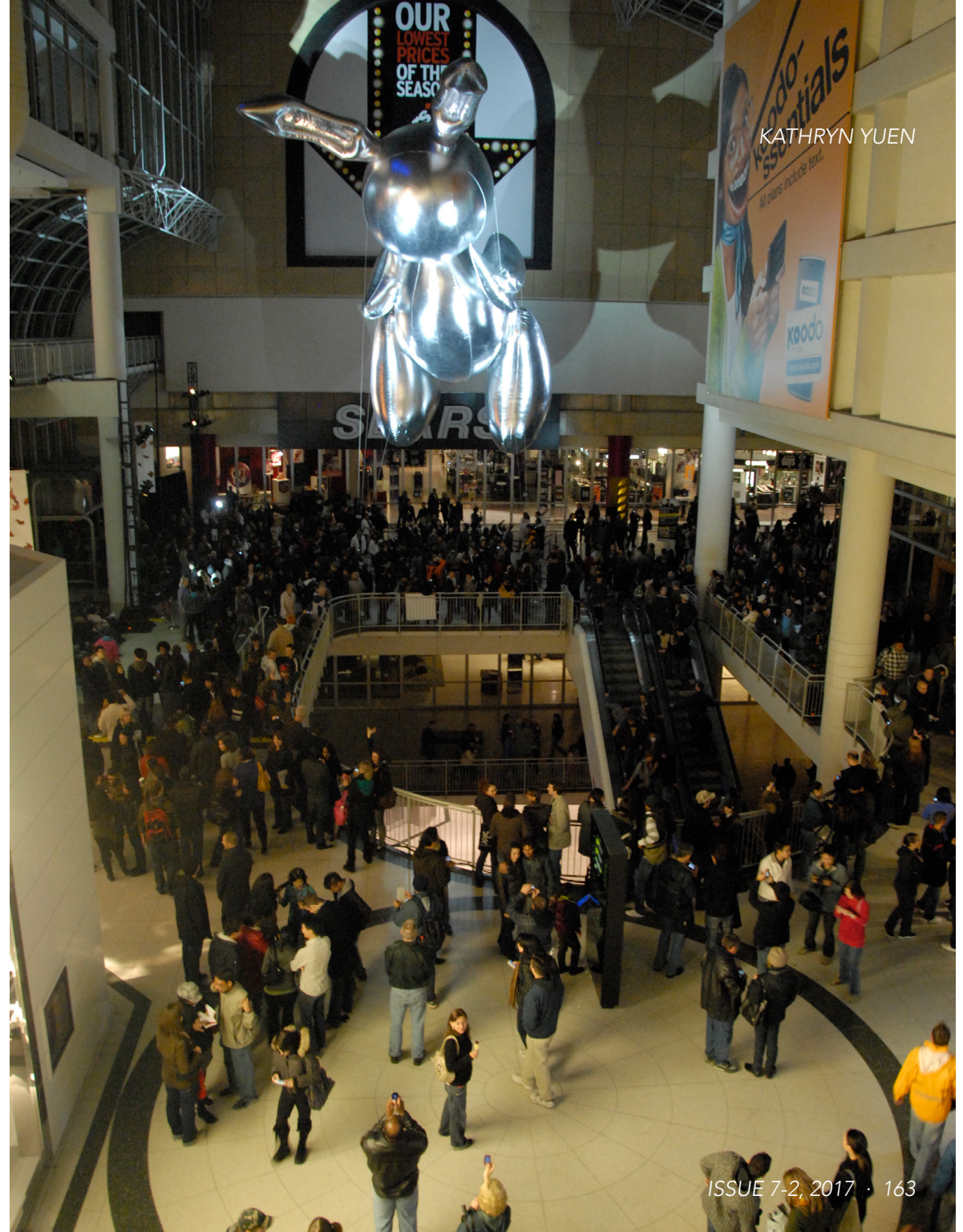
Fig. 4. (left) Project Blinkenlights, Stereoscope, 2008.

Spectacular artworks and their vibrant aesthetics are particularly seductive through the filter of a camera or through the intoxication of drugs. Amongst the hordes of people attending Nuit Blanche, it appears to me that fewer and fewer are engaged with each other, or with the artworks, in an active and direct way. In wandering the streets of Toronto during the most recent Nuit Blanche, the distinctive scents of alcohol and marijuana wafting through the air have become common. In addition, I have observed that the majority of people experience the event and its artwork through the screens of their smartphones, in what might be seen as a form of passive participation. In fact, over the years, a growing number of news reports claim that the social scene at Nuit Blanche has become one of urban spectacle, filled with