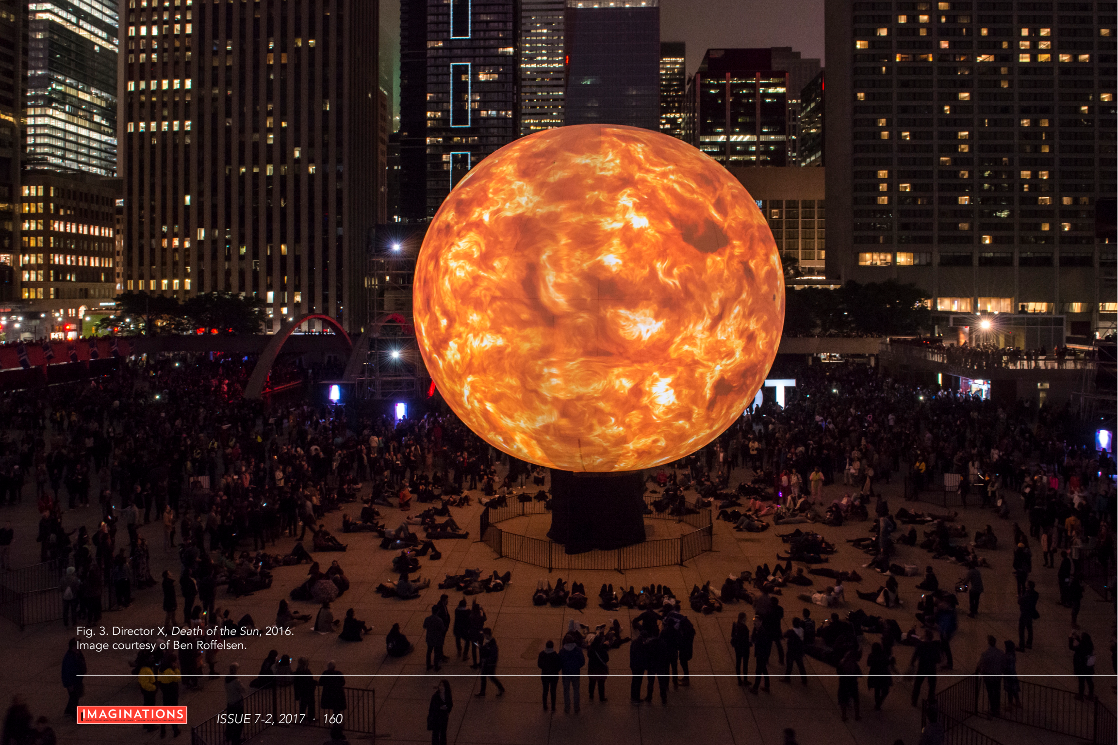
Fig. 3. Director X, Death of the Sun , 2016.