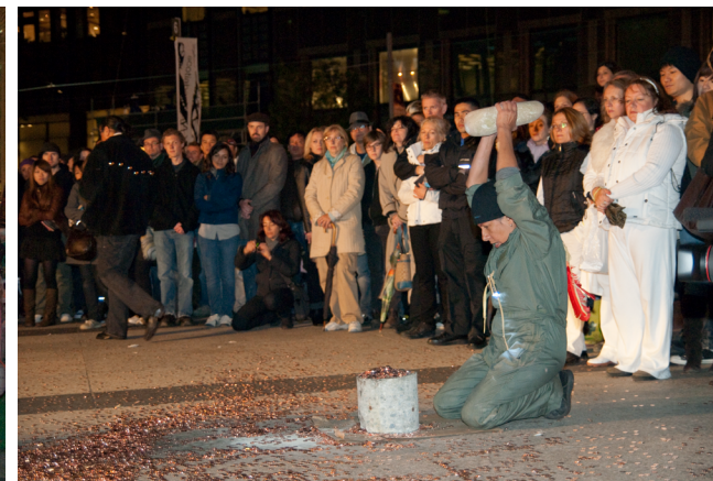
Fig. 1a & 1b - Rebecca Belmore, Gone Indian , 2009.