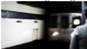
Animal Crossing Underground

FOR THE INAUGURAL ISSUE of Imaginations I created three Vidoodles ideally for consumption on a handheld portable device.