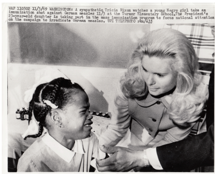
Figure 1: Anonymous photographer, Untitled , 1969, photographic print. Photo credit: United Press International Photo.

For example, the photograph Untitled (Figure 1) is a press image for an unknown US newspaper in 1969. In it, an African American girl with braided hair is grimacing either in fear of a needle before vaccination or in pain after the event of vaccination. Slightly above her is Tricia Nixon, the elder daughter of the 37 th president of the United States, Richard Nixon. Nixon is bending her upper body forward and gazing at the girl, as if comforting the child while overseeing the immunization scene. The photo is accompanied by the following text: “A sympathetic Tricia Nixon watches a young Negro girl take an immunization shot against German measles 11/3 at the Turner Elementary School. The President’s 23-year-old daughter is taking part in the mass immunization program to focus national attention on the campaign to eradicate German measles.” The accompanying text clarifies the bifurcation between “a young Negro girl” and Nixon, as a member of the white elite and a political figure. The message of the photograph