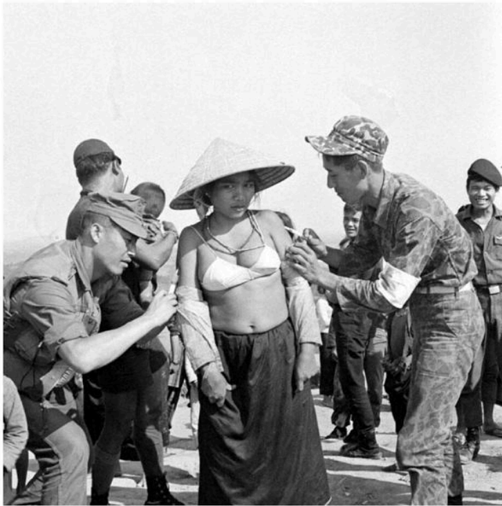
Figure 2: Anonymous photographer, South Korean Soldiers of Blue Dragon Units in Vietnam Administering Vaccine on a Montana Woman, 1967, the National Archive of the Republic of Korea, Photography Office of the Public Relations Department, the Bureau of Public Information.

A similar message is produced by Figure 2. This photographic print shows the South Korean soldiers of the Blue Dragon Units administering a vaccine to a Vietnamese woman of the Montana ethnic minority during the Vietnam War. Figure 2 is one of eight photos capturing the Blue Dragon Units' vaccination activity among the Montana people. An ally of the United States, South Korea dispatched 35,000 soldiers to Vietnam as combat troops for monetary benefit. Park Chung-hee's military regime promoted Korean soldiers in Vietnam as heroes who sacrificed themselves for the sake of national prosperity and in-