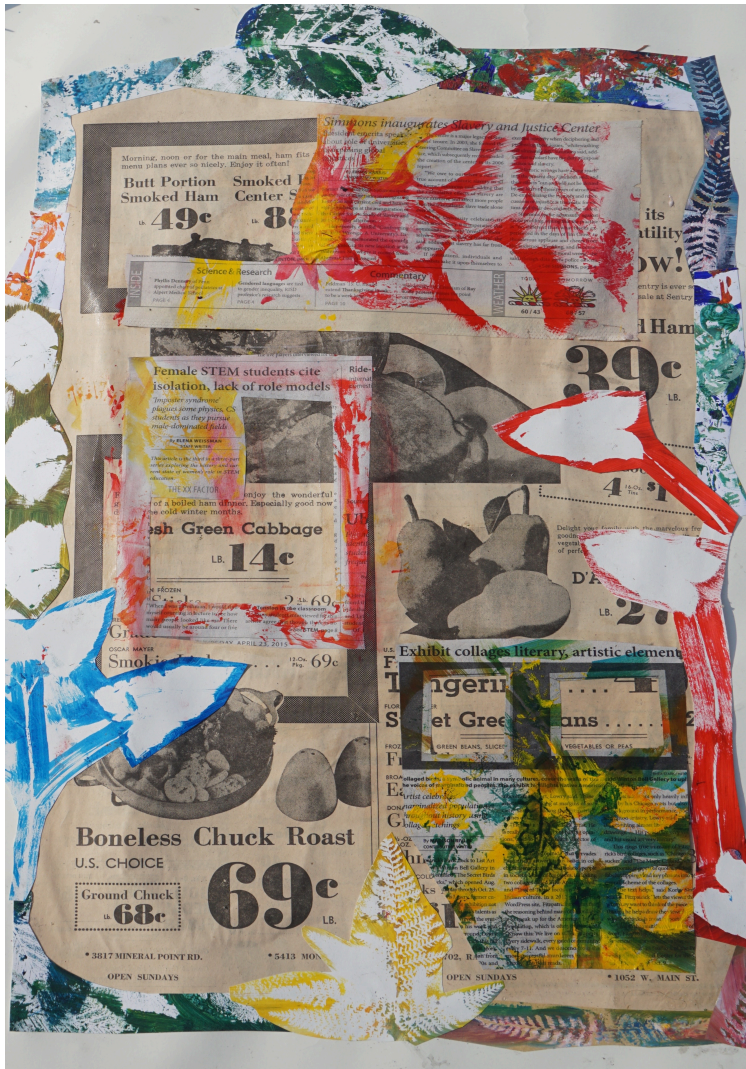
The first panel in this series of three images features Athyrium angustum (northern lady fern) in the centre and maintains the standard centrality of plants. The middle panels contain articles highlighting the threat to liberalism and universities that white liberals perceive